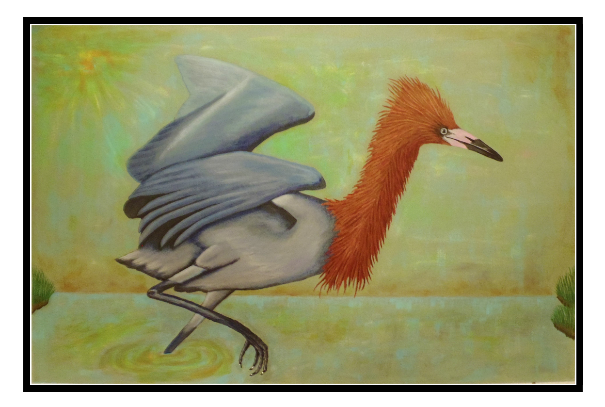
Reddish Egret (24" x 36")