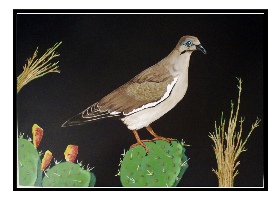
White-winged Dove (16" x 20")