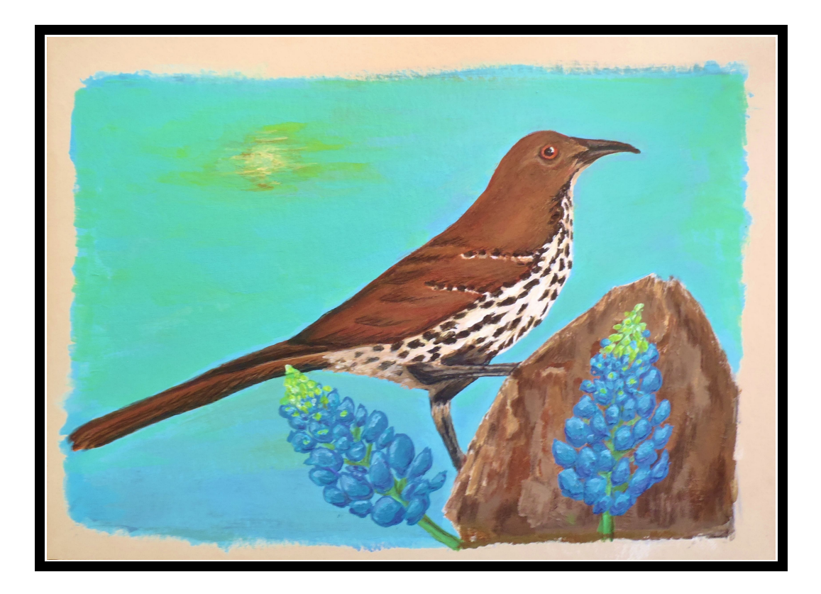
Long-billed Thrasher (11" x 14")