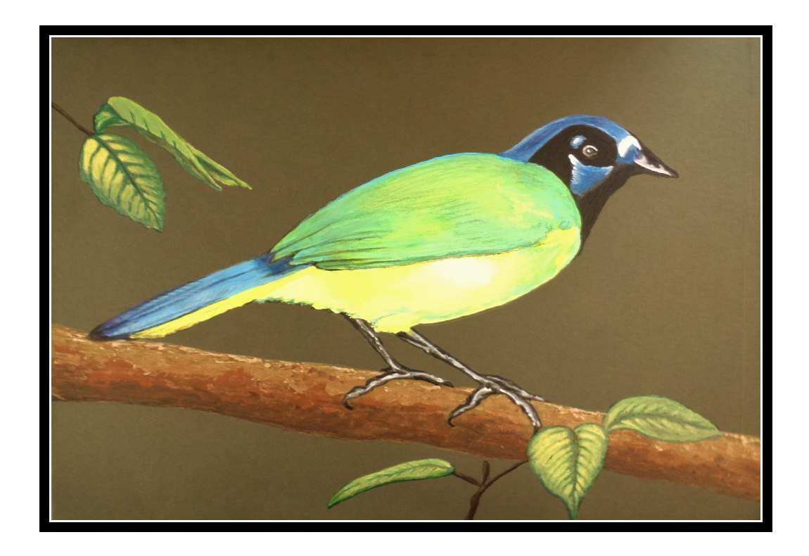
Green Jay (11" x 14")